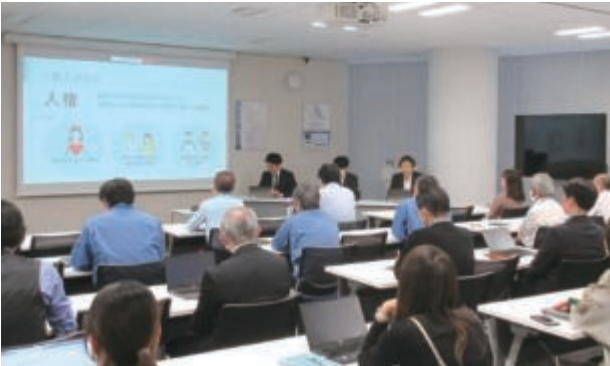
Human Rights and Compliance Training

The RIKEN TECHNOS GROUP Compliance Manual, which consolidates topics such as the matters to be observed by Group employees and methods of response when an issue has occurred, is made known to our officers and employees as well as consolidated subsidiaries in Japan and overseas, and we make periodic revisions to the manual.