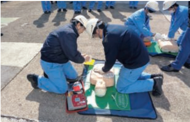
Emergency Response Training (R&D Center)

The RIKEN TECHNOS GROUP anticipates various situations—such as natural disasters, cyberattacks, and political and geopolitical risks—to quickly and accurately respond to risks that are becoming more diversified and complex. We have established and are strengthening our business continuity management (BCM) structure to ensure a stable supply of essential products and business continuity. In this way, we strive to minimize management risk from business disruptions and improve the resilience of our entire supply chain. We also put in place a system for minimizing damage and losses by stating the organizational structure during emergency situations, specific procedures of each employee, and other such matters in the Emergency Response Basic Regulations and Disaster Response Procedural Manual and conducting regular training.