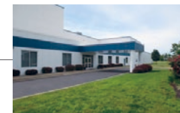
24 RIKEN AMERICAS CORPORATION