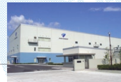
8 Gunma Factory ★★