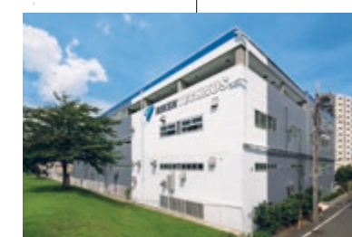
10 R&amp;D Center (Tokyo) ★★