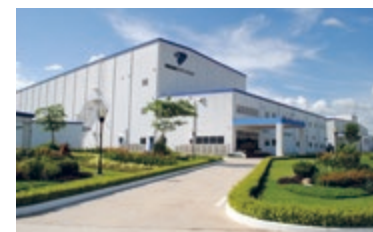
22 RIKEN VIETNAM CO., LTD. ★★