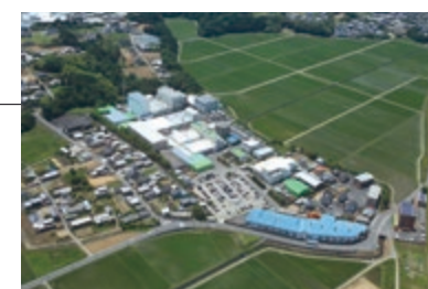
7 Mie Factory ★★