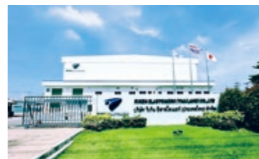
16 RIKEN ELASTOMERS (THAILAND) CO., LTD. ★★