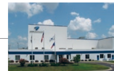
21 RIKEN ELASTOMERS CORPORATION ★