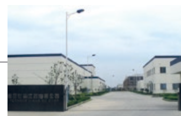
19 RIKEN TECHNOS (JIANGSU) CORPORATION ★