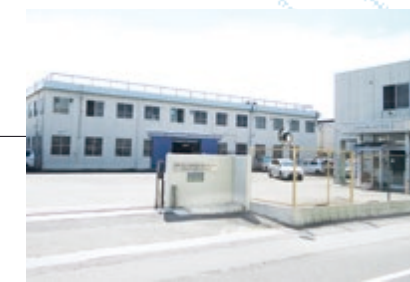
11 RIKEN CABLE TECHNOLOGY CO., LTD. ★★