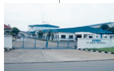
17 PT. RIKEN INDONESIA ★★