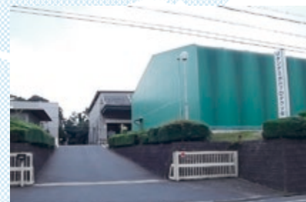
13 RIKEN CHEMICAL PRODUCTS CO., LTD. ★