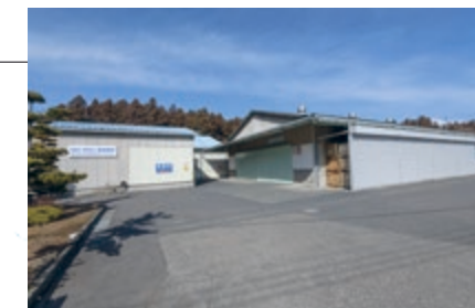
12 KYOEI PLASTIC MFG CO., LTD. ★