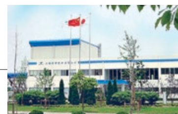
18 SHANGHAI RIKEN TECHNOS CORPORATION ★★