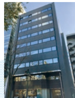
5 Sapporo Sales Office