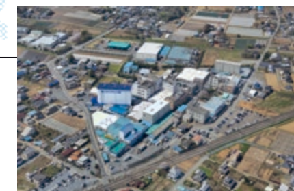
6 Saitama Factory ★★