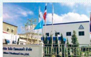
15 RIKEN (THAILAND) CO., LTD. ★★