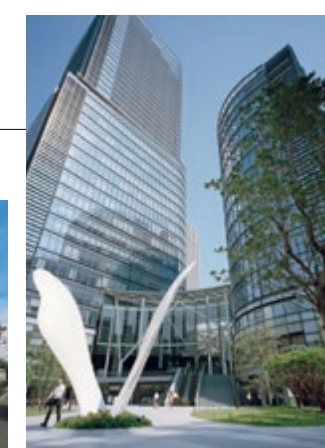
1 Head Office ★★