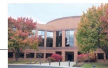
25 RIKEN U.S.A. CORPORATION