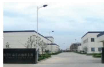
19 RIKEN TECHNOS (JIANGSU) CORPORATION *