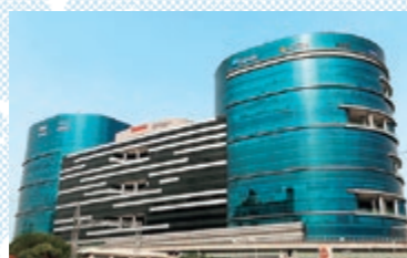
26 RIKEN TECHNOS INDIA PVT. LTD.