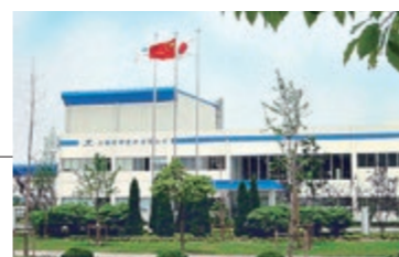
18 SHANGHAI RIKEN TECHNOS CORPORATION **