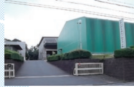
13 RIKEN CHEMICAL PRODUCTS CO., LTD. ★