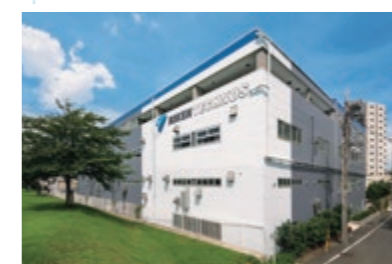
10 R&D Center (Tokyo) ★★