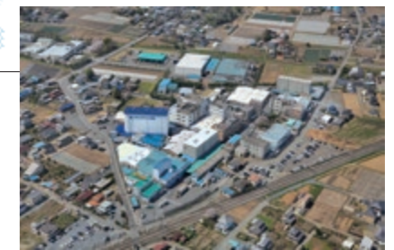
6 Saitama Factory ★★