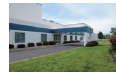
24 RIKEN AMERICAS CORPORATION