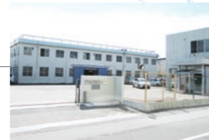
11 RIKEN CABLE TECHNOLOGY CO., LTD. ★★