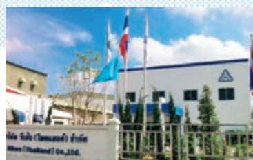
15 RIKEN (THAILAND) CO., LTD. **