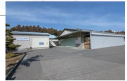
12 KYOEI PLASTIC MFG CO. LTD. ★