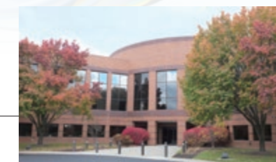
25 RIKEN U.S.A. CORPORATION