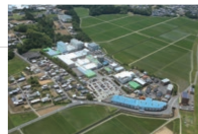
7 Mie Factory ★★