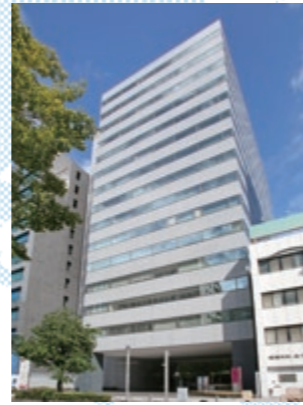
3 Nagoya Sales Office ★★