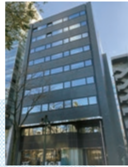
5 Sapporo Sales Office