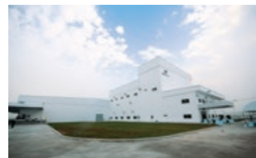
16 RIKEN ELASTOMERS (THAILAND) CO., LTD. **