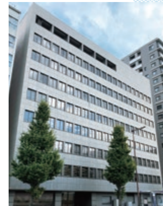
4 Fukuoka Sales Office