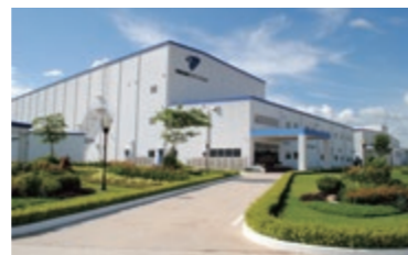
22 RIKEN VIETNAM CO., LTD. **