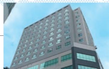
23 RIKEN TECHNOS INTERNATIONAL KOREA CORPORATION