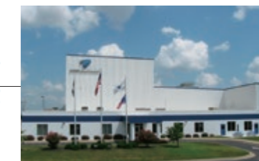
21 RIKEN ELASTOMERS CORPORATION *