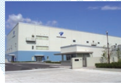
8 Gunma Factory ★★