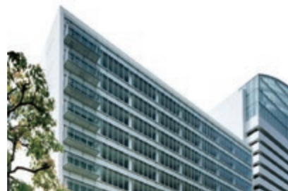
2 Osaka Branch ★★