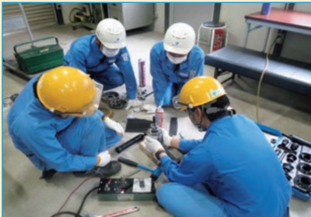
Experiencing bearing installation at the Engineering Department

Two students from Kameyama High School went through a five-day workplace experience.