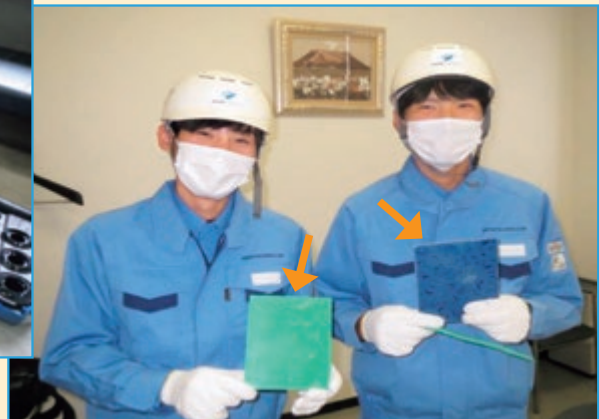
Made exemplary erasers at the R&D Center