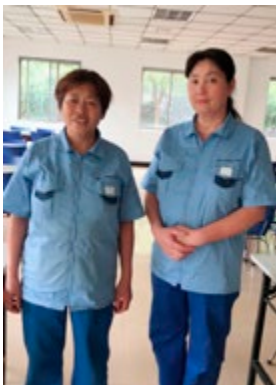
Senior citizen cleaning personnel

At RIKEN TECHNOS (JIANGSU) CORPORATION, all employees began cleaning the inside of the factory and its surrounding area as part of the 6S (sort, set in order, standardize, shine, sustain, and safety) methodology.