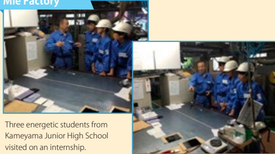
Three energetic students from Kameyama Junior High School visited on an internship.

Here are the thoughts of two students who participated in the workplace experience event held in the Saitama Factory in February 2019. (Excerpts)