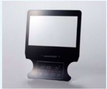
Displays for automobiles