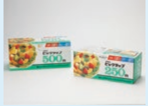
● Blue wrap "Ocean"