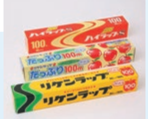
● RIKEN BIG WRAP