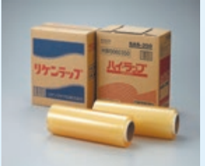
● FOR WRAP