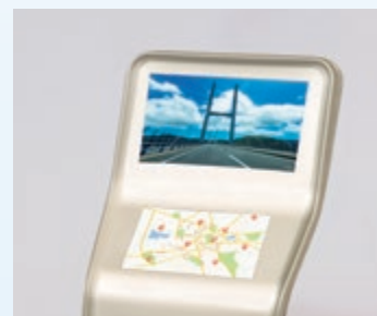
Allows 3D molding