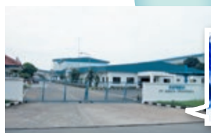
15 PT. RIKEN INDONESIA * *