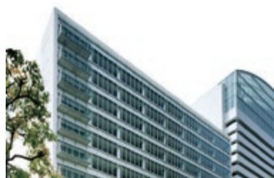
2 Osaka Branch Office **