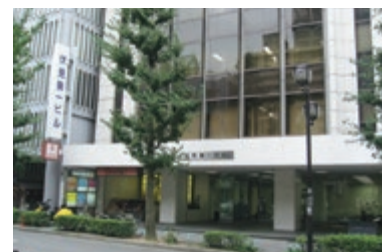
3 Nagoya Sales Office **