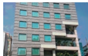
23 RIKEN TECHNOS INTERNATIONAL VIETNAM CO., LTD.