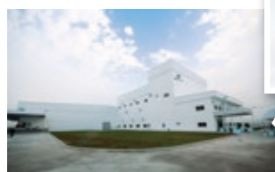
14 RIKEN ELASTOMERS (THAILAND) CO., LTD. * *