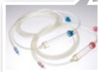
20 RIKEN VIETNAM CO., LTD. * *