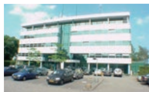
26 RIKEN TECHNOS EUROPE B.V.