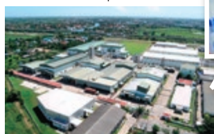
13 RIKEN (THAILAND) CO., LTD. * *