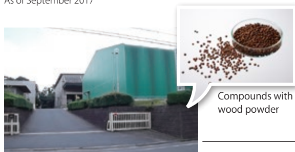
11 RIKEN CHEMICAL PRODUCTS CO., LTD. *