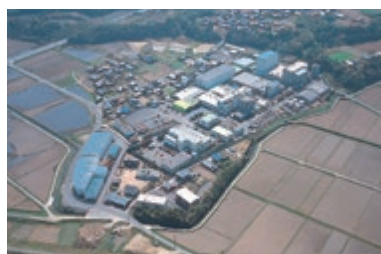
5 Mie Factory ** R&D Center (Mie) **